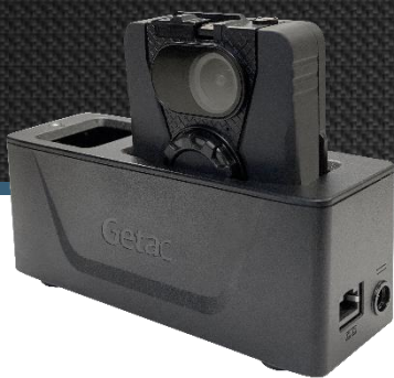
Single-Unit Charging Dock