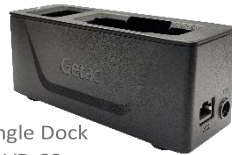
Single Dock VD-03 ORB27X