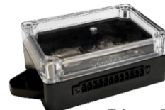
Trigger Box OTX11X