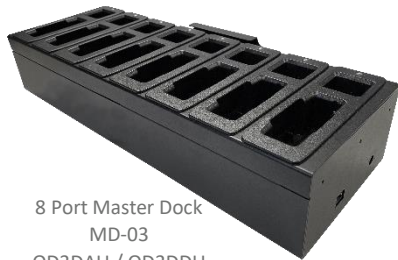
8 Port Master Dock MD-03 OD3DAU / OD3DDU

Warranty: 1 Year Standard limited warranty*. Extended plans available.