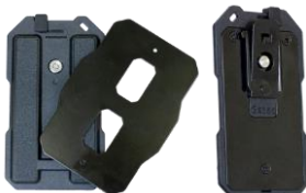
Magnetic Mount Single-ORB36X Dual-ORB41X