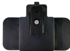
Chest Mount ORB33X