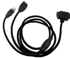
Magnetic Charging Cable ORB42X