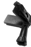
Swivel Mount ORB43X