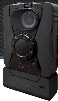
Swappable Secondary Battery