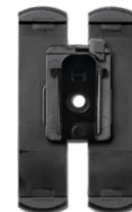
Molle Mount ORB34X